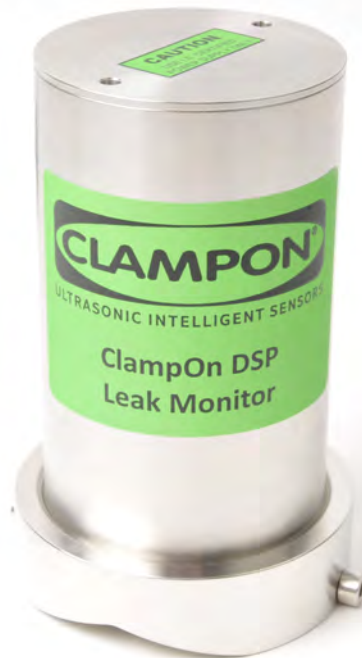
ClampOn DSP Leak Monitor Ex ia version.