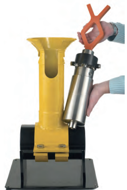
Subsea version of the ClampOn DSP Leak Monitor.

The basic theory is that a leak creates a very high-frequency noise that can be monitored by an ultrasonic sensor. In a «non-leak» situation the ultrasonic pattern will be stable, but when a leak occurs the signature will change drastically. The ClampOn DSP Leak Monitor is based on the ClampOn Ultrasonic Intelligent Sensor technology platform. The instrument's ability to monitor signal at multiple frequency, combined with extreme sensitivity enables it to distin-