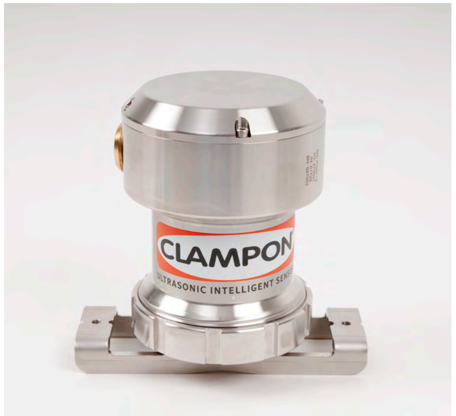
ClampOn DSP Leak Monitor Ex d version