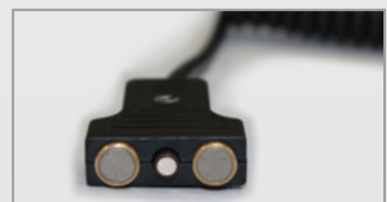
for Portable and 2x models