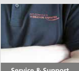
Service & Support

Laser measurement systems and services for optimum machine and asset alignment.